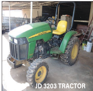
JD 3203 TRACTOR